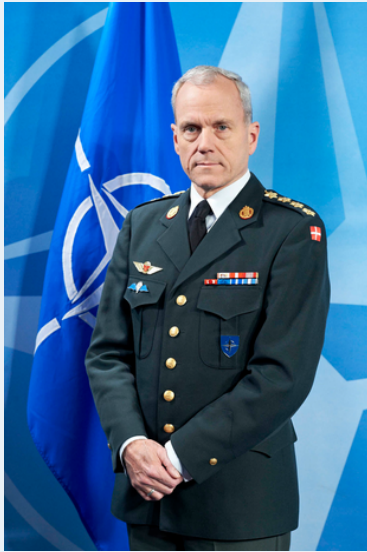
Gen. (ret.) Knud Bartels